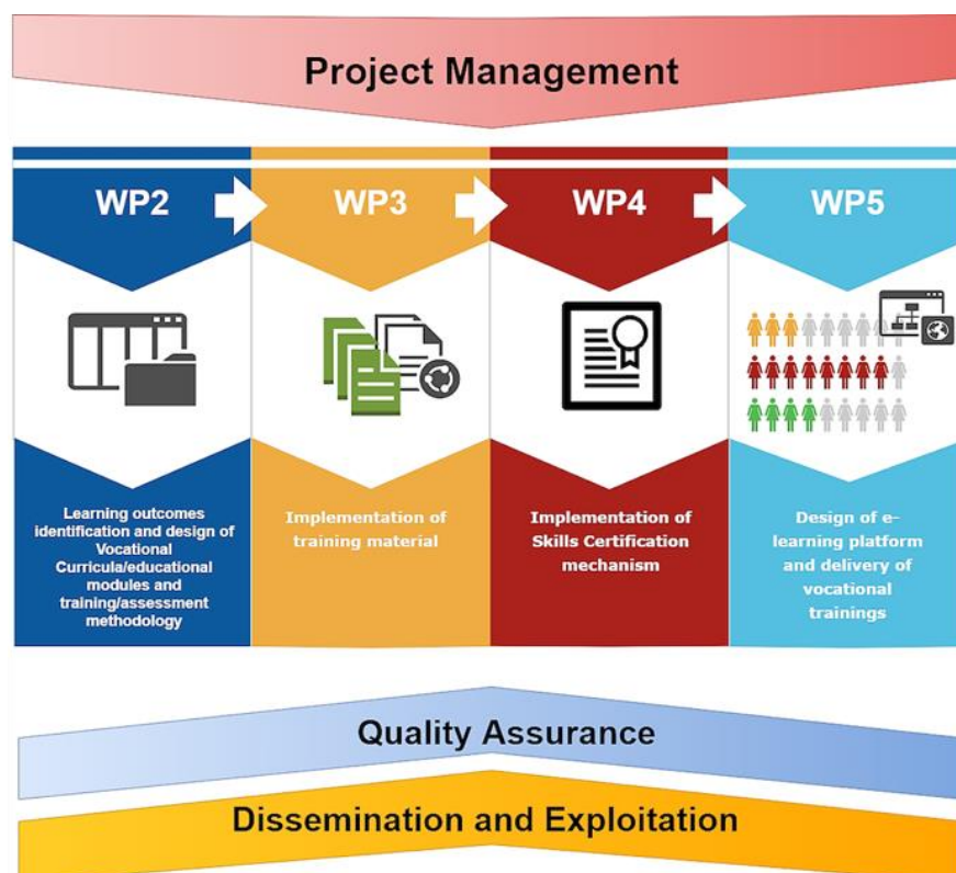
Figure 2: Work-plan of SEnDIng project