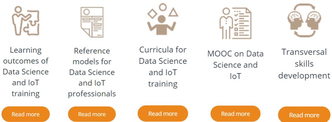
Figure 5: Main results of SEnDIng project